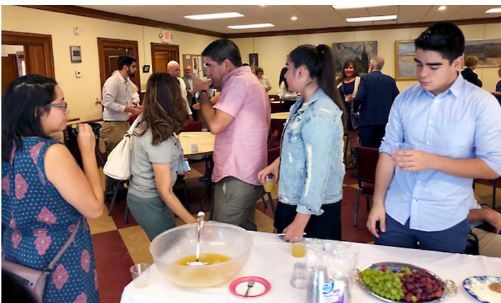
Students in the DACA program enjoy snacks during an event on Sept. 23 at Trinity, Lawrence, to award college scholarships.

TRINITY, LAWRENCE, hosted a reception Sept. 23 for area students in the Deferred Action for Childhood Arrival program, during which six $500 scholarships were awarded. This is the second year awards have been made.